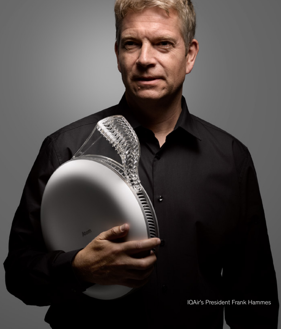
IQAir's President Frank Hammes

“ The Atem is a small but incredibly powerful personal air purifier that removes up to 99% of particles through IQAir’s proprietary HyperHEPA® filtration, including ultrafine particles. “